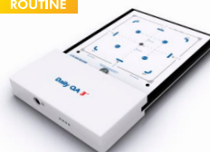
Daily QA 3™