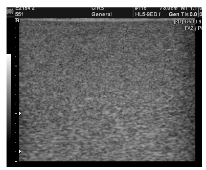
Ultrasound scan of CIRS Accreditation Phantom for Uniformity using Linear Transducer.