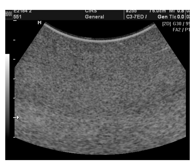
Ultrasound scan of CIRS Accreditation Phantom for Uniformity using Curved Array.