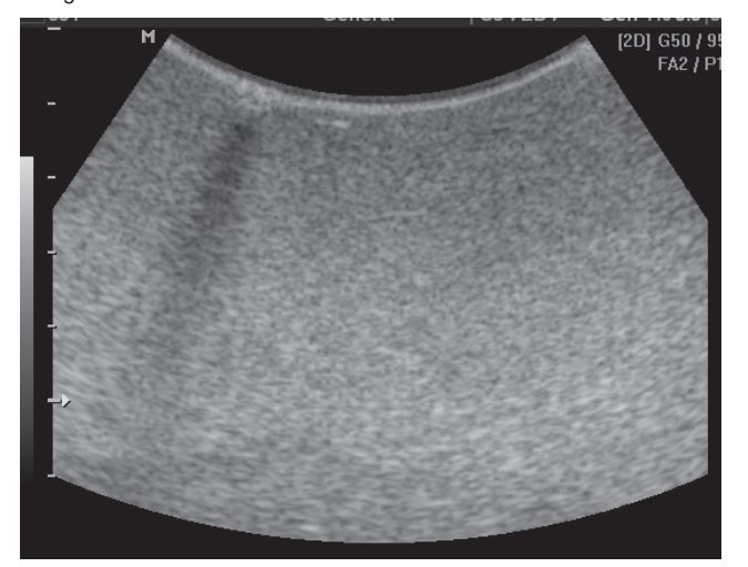
Accreditation Phantom for Uniformity ultrasound image with dead element.