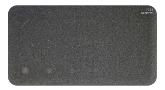
Mammo FFDM Phantom Wax Insert

The Mammo FFDM Phantom simulates radiographic characteristics of compressed breast tissue, including micro-calcifications, ductal fibrous structures and tumor-like masses. Identification of these small structures is essential to the early detection of breast cancer.