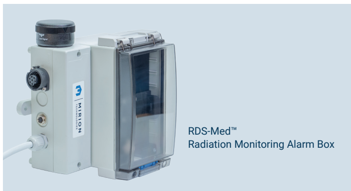
RDS-Med™ Radiation Monitoring Alarm Box