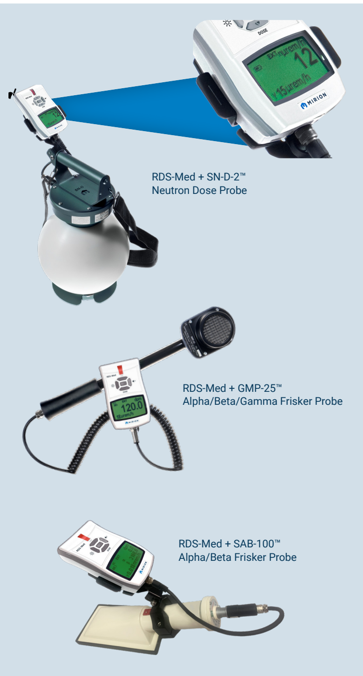
RDS-Med + SN-D-2™ Neutron Dose Probe